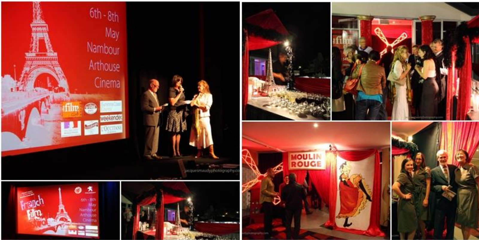
Festuri 2011 - 09/10/2011