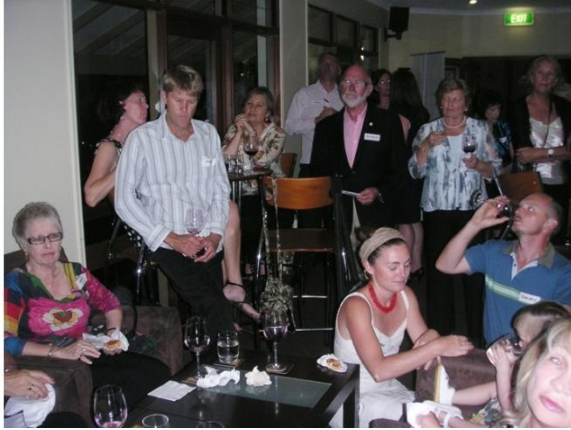
Beaujolais Nouveau 2011